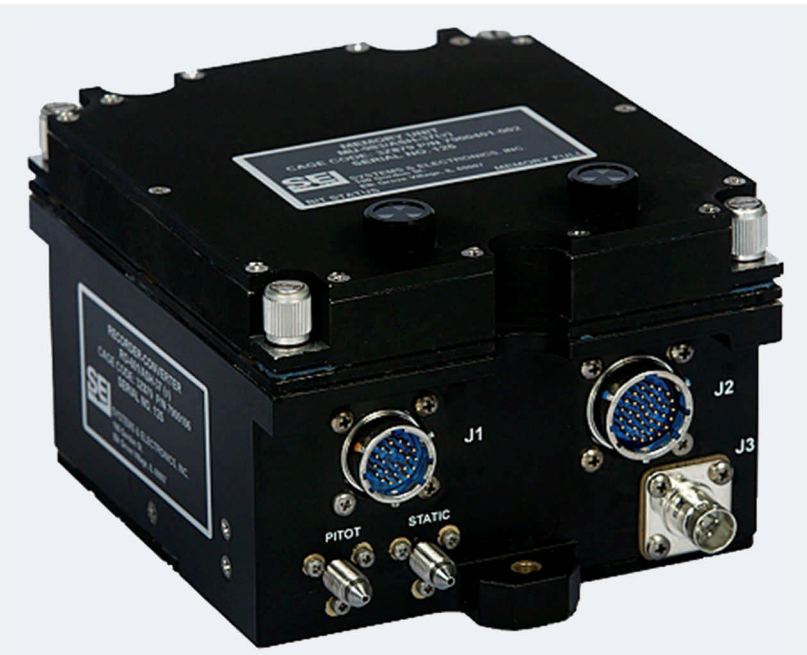
Recorder Converter (RC) with Memory Unit (MU)